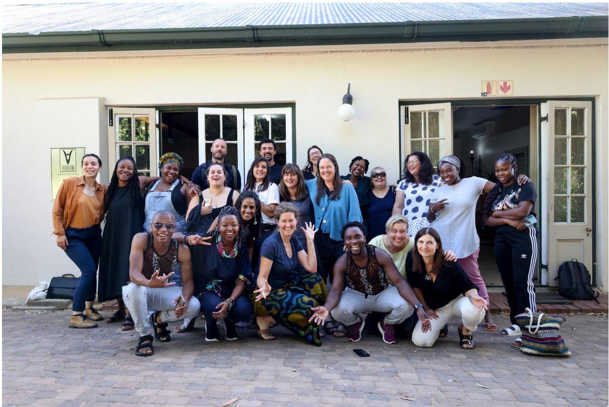
CSLZA 2023 participants, speakers and hosts

We firmly believe that storytelling can reach into people's hearts and minds, shift behaviour and inspire action. Now is the time to harness our creative energy to support urgent and innovative action on the climate crisis.